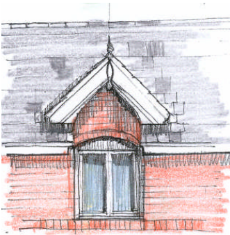
An example of a Victorian half dormer