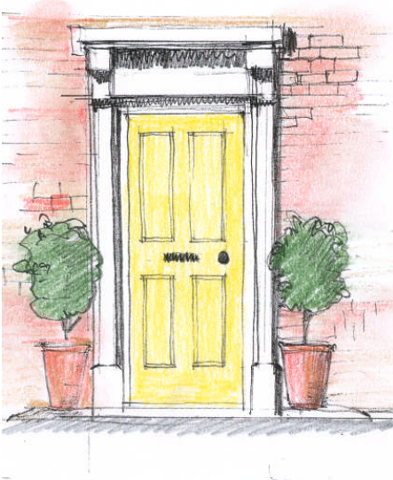
Classical door with simple canopy over