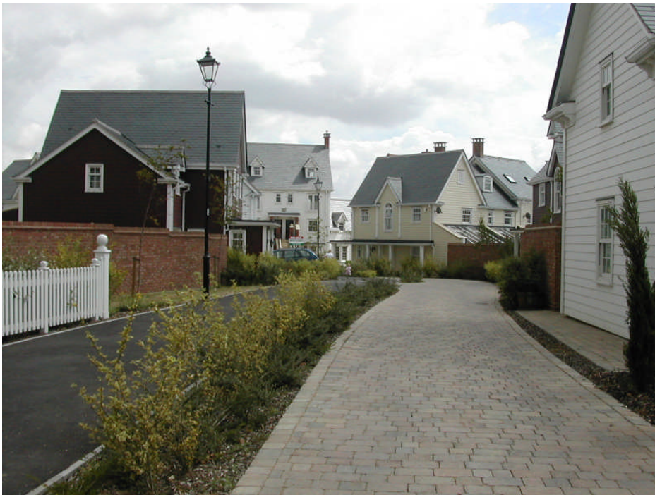
Weatherboard example - Beaulieu Park, Chelmsford